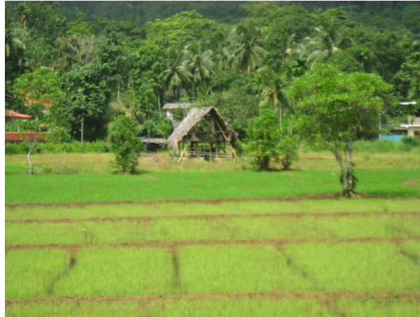
Ratnapura, Sri Lanka

In Sri Lanka, still known as Ceylon, we often tour sapphire mines that are underneath fields of rice paddies, manned by locals who double as farmers and miners, blessed by the existence of two sources of income on one area of land.