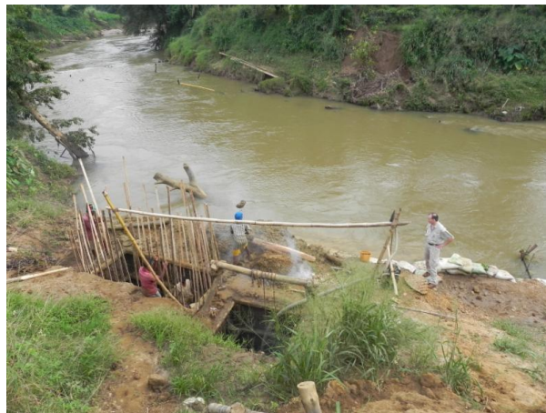
Ratnapura, Sri Lanka

Sapphire, the mineral Corundum, is the result of volcanic action pushing the minerals to the surface of the earth, where it leaves them on mountain peaks. Through erosion, they're carried down into riverbeds; today men venture into muddy riverbanks and carry up baskets of gravel in search of one of the world's most precious elements.