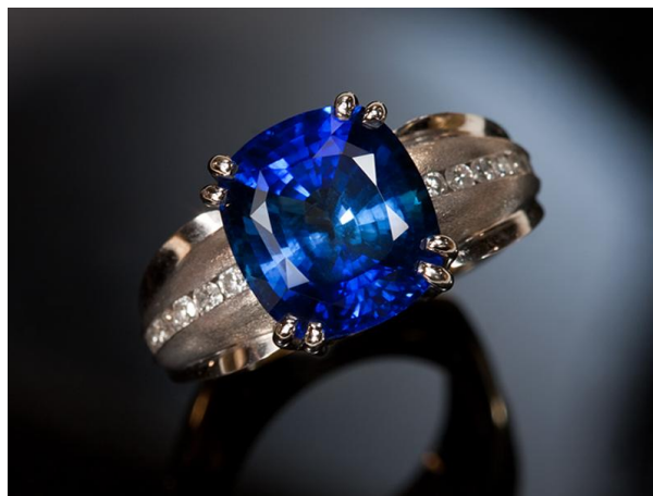
6.33ct Ceylon Sapphire

In case you were wondering, Roger's favorite sapphires come from Sri Lanka, in the sort of deep, rich cornflower blue that you see below.