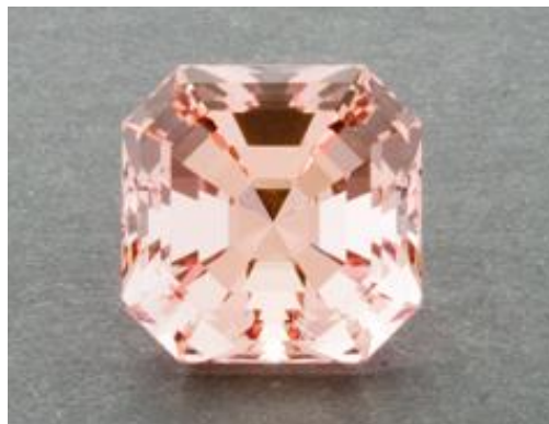
32.77ct Madagascan Morganite