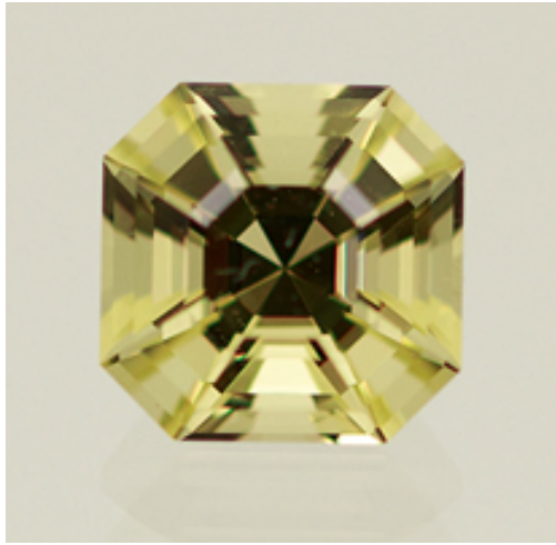
2.75ct Madagascan Orthoclase